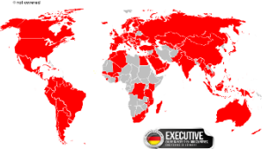
Country Coverage TARKAN EXECUTIVE Version