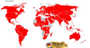
Country Coverage TARKAN PREMIUM Version