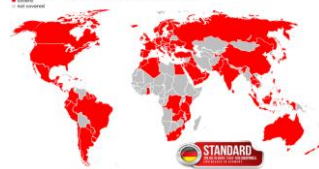
Country Coverage TARKAN STANDARD Version