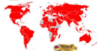
Country Coverage TARKAN PREMIUM Version