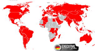
Country Coverage TARKAN EXECUTIVE Version